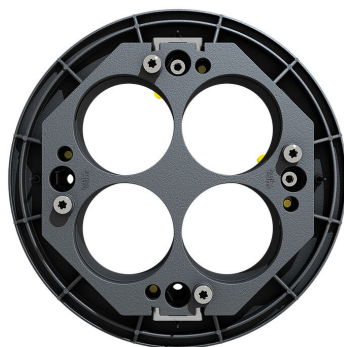
ETGAR wall sleeve for building services outlet