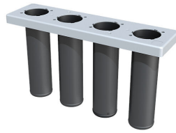
Seal insert for basic insert