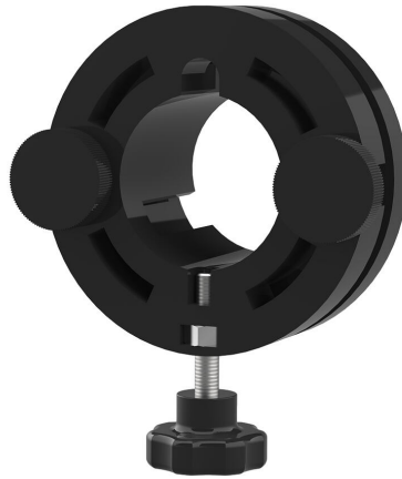
Quick tensioning device