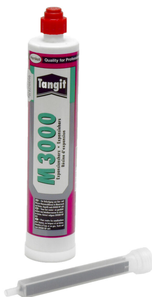
2-component resin M3000