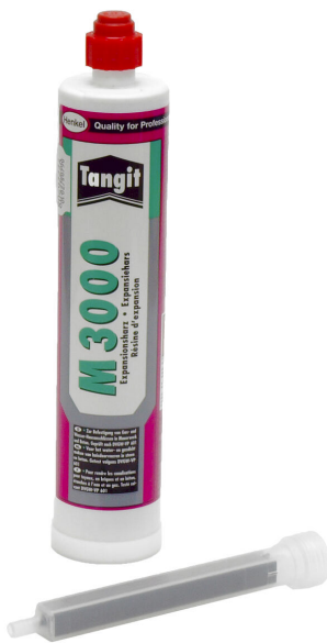
2-component resin M3000