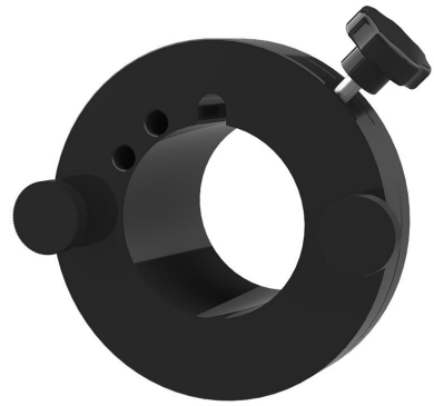
Quick tensioning device