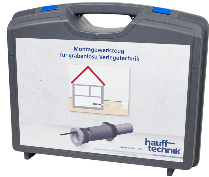
Assembly kit MIS NoDig