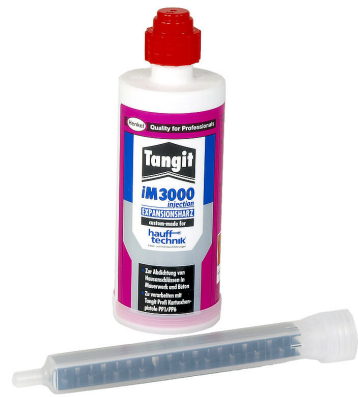
2-component resin iM3000