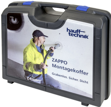
ZAPPO assembly kit