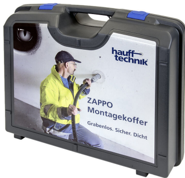
ZAPPO assembly kit