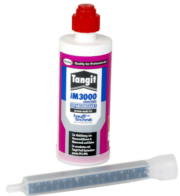
2-component resin iM3000