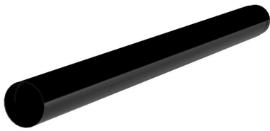
ZAPPO driving pipe