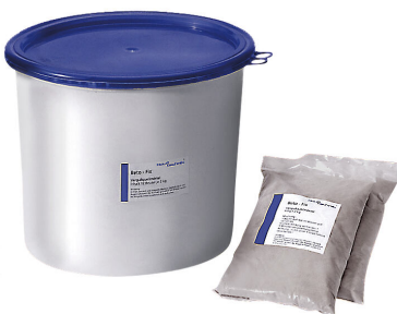
Hauff - Beto - Fix void-filling mortar