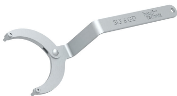
Flexible socket wrench