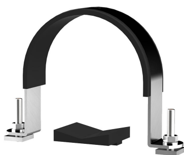
Fastening bracket 160