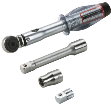
Toolset for KES-M