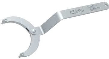
Flexible socket wrench