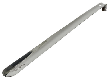
Assembly plate for fire-stop pads