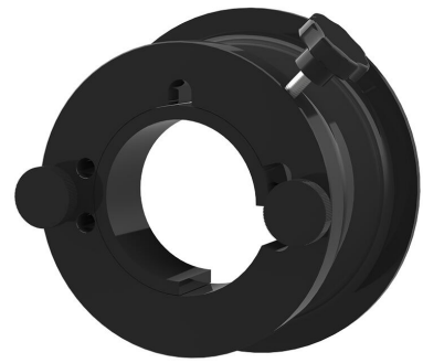
Quick tensioning device MIS