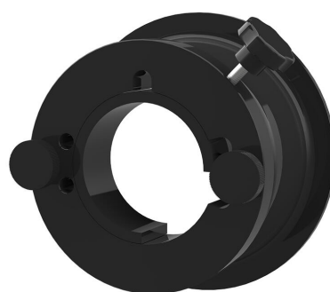
Quick tensioning device MIS