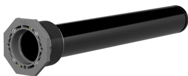
Basic variant with inner seal