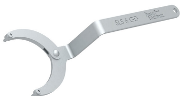
Flexible socket wrench