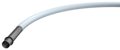
Spiral hose system