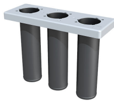
Seal insert for basic insert