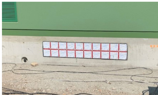
Scheidt GmbH & Co. KG opted for the HSI150 as a permanently gas and watertight cable entry.