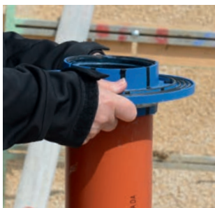
Plug on. Tight.