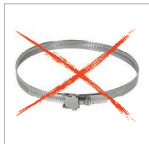
no fastening strap required